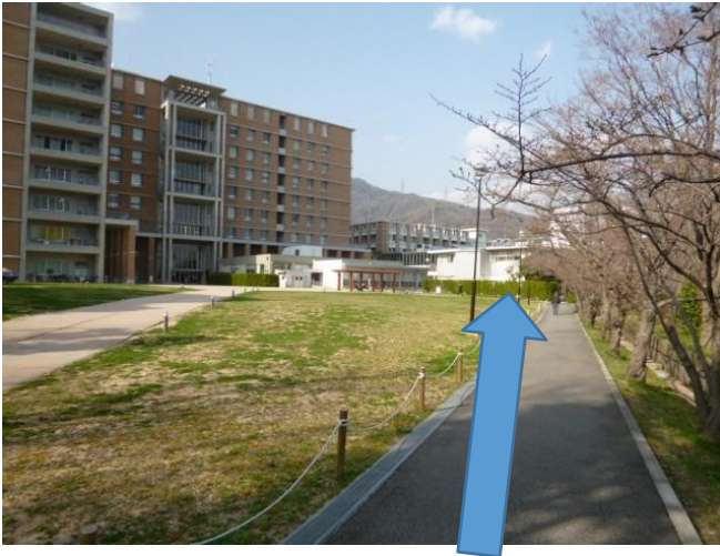
(4) Go straight.