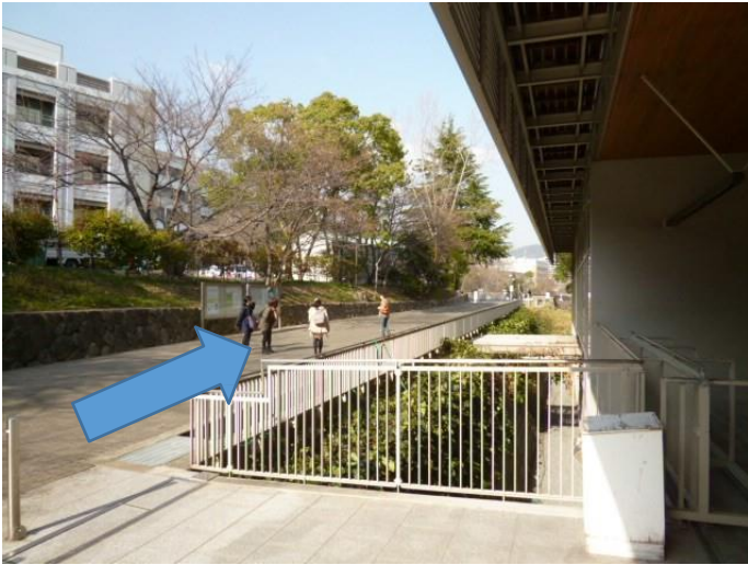
(1) Get out of the hall and turn right.