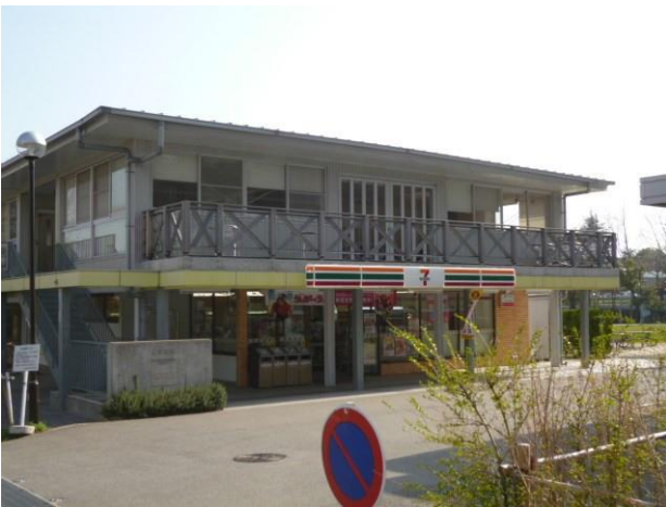
(5) You will find the convenience store, The Seven & Eleven. You can buy snacks, light meals, drinks, hot coffees, and use the copy machine and ATM.