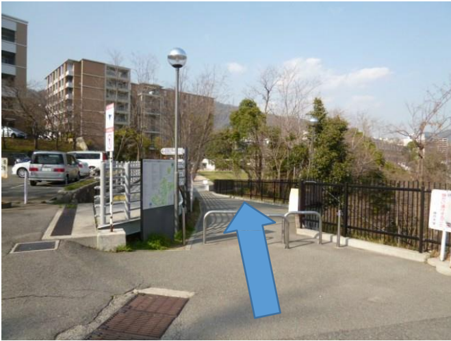
(3) Go to the right road.