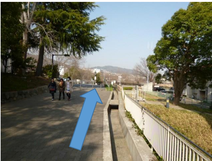
(2) Go straight.