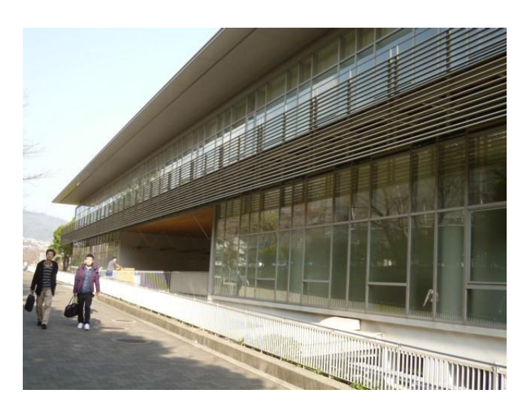
(9) This is the university's centennial hall, the venue for the symposium.