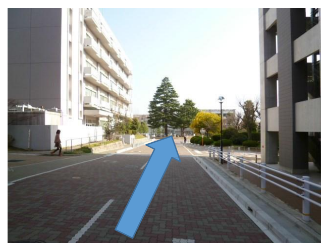
(6) You will see a tall tree ahead. Go to the tree.