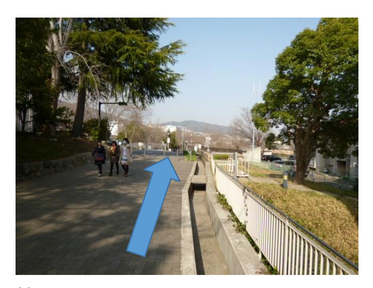
(2) Go straight.