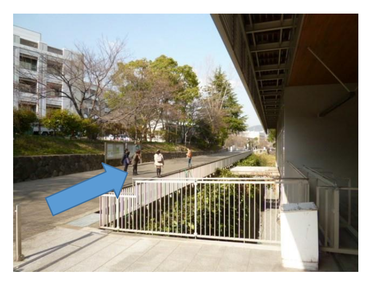
(1) Get out of the hall and turn right.