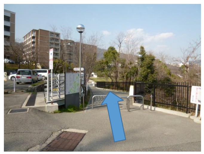
(3) Go to the right road.