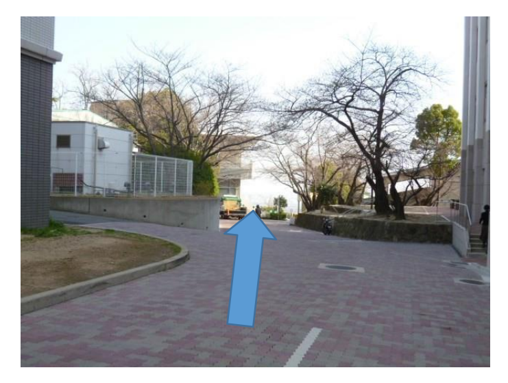
(8) Go straight, and turn left.