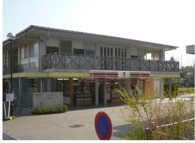
(5) You will find the convenience store, The Seven & Eleven. You can buy snacks, light meals, drinks, hot coffees, and use the copy machine and ATM.