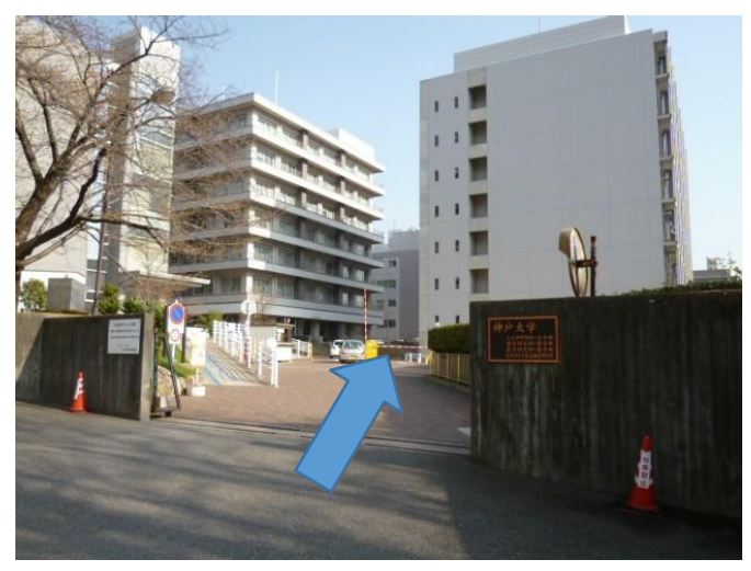
(5) Get off at the Shindai Buri Nougakubu Mae Bus stop. You will see the entrance of the campus on your right. Enter the campus and go straight.